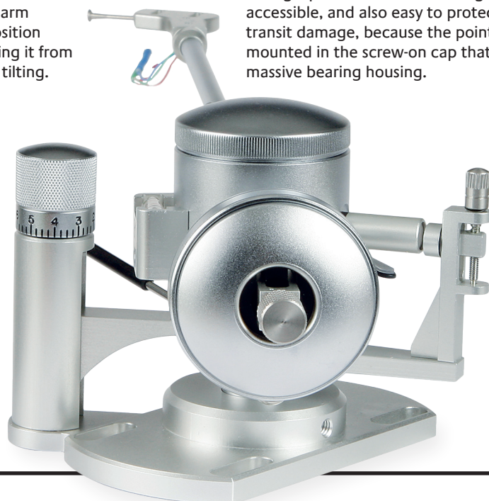
RIGHT: Seen far right is the Magne glide stabiliser, using magnets in line with the arm's pivot point. The outrigger magnet can be moved up or down for azimuth correction

'The E-Go delivers guitar heroics by the bucketload'